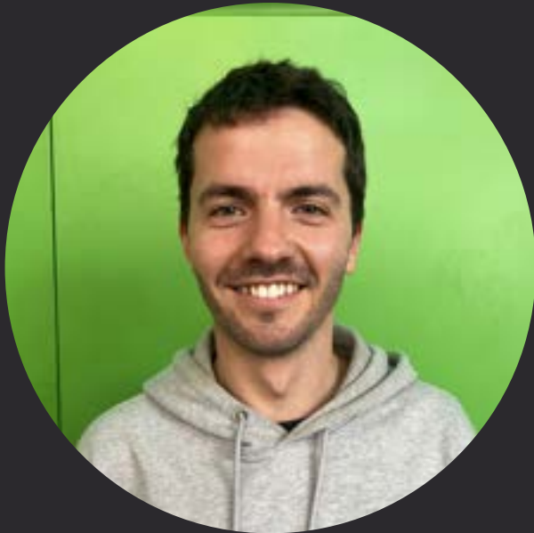
MAX SALES TEAM