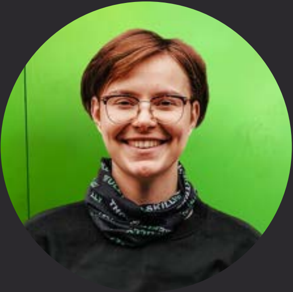
BORI SALES TEAM HSD P5i