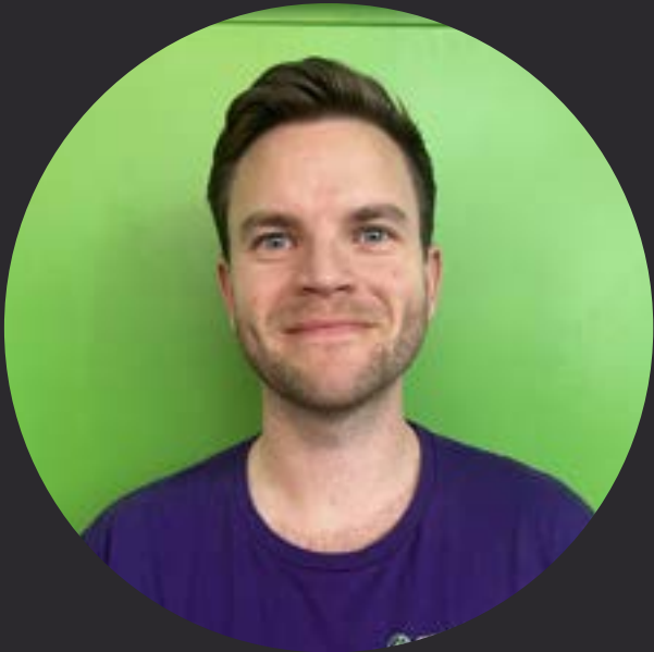
RICH SALES TEAM HSD P5i